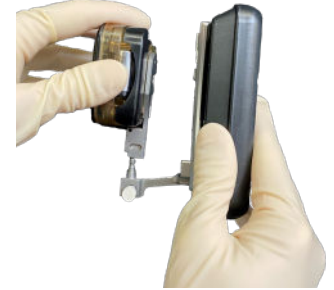
Attach sensor to bracket