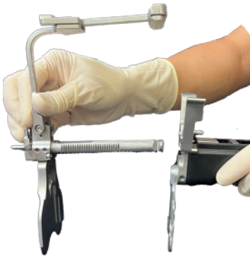
Insert gear rack