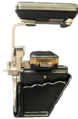
Insert calibration bracket