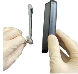
Attach unit to bracket