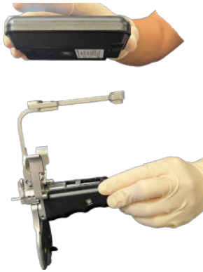
Attach unit to bracket