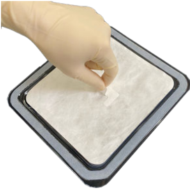
Transfer into sterile field