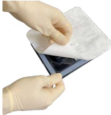
Open inner package